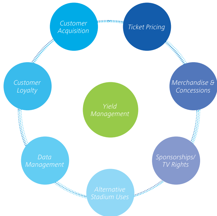
Figure 1: Dynamic pricing connects the variables of yield management

Your franchise has valuable data right at its fingertips, but may lack the ability to use it to generate management-relevant insights. Deloitte has deep Knowledge/experience in data mining and data representation methodologies to uncover customer purchase behaviors and patterns that lead to highly actionable revenue opportunities, such as determining whether and how much team performance influences a willingness to pay (especially compared to the stats of a visiting team).